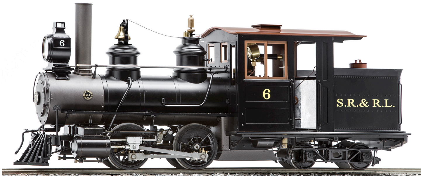
B77-571 SR & RL 0-4-4 FORNEY #6

The Portland Company constructed 0-4-4 Forney #5 in 1891 for the Sandy River Railroad. The locomotive was named "N.B. Neal" and operated this way until 1908 when the Sandy River, Franklin & Megantic, Philips & Rangeley, along with their respective subsidiary railroads merged to form the Sandy River & Rangeley Lakes. At this time the loco was renumbered to SR&RL #6. In 1925 the loco was sold to the Kennebec Central, becoming their #4. She was again sold in 1933 to the Wiscasset, Waterville & Farmington as their #9. After the WW&F railroad was abandoned in 1936-'37, it was purchased and stored near Putnam, Connecticut.